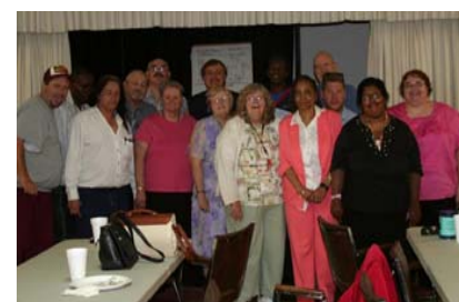
Adventure House Players following a performance at Friendship United Methodist Church In Fallston, NC